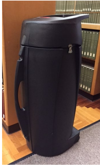
Shipping container, 48" H x 19" W x 19" D

Each exhibition travels in one or two wheeled containers with banners and hardware packed in cloth bags. See below outside and inside images of a shipping container.